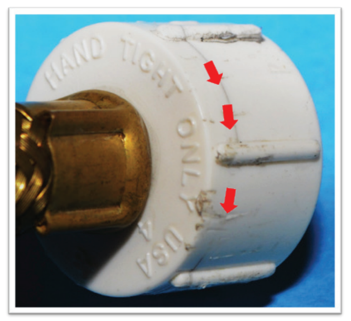
Figure 3 Failed ballcock nut. Warning: "Hand Tight Only."

b. A manufacturing defect is simply an imperfection within the component that was the result of the manufacturing process. For example, if the design of the brass product discussed above specified a low-zinc brass alloy but high-zinc alloy was utilized during manufacturing, then the product defect is considered to be a "manufacturing defect" because the part was not manufactured to its design specification.