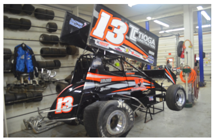
Figure 3 Image of decedent's Sprint Car.

A cone was placed at Turn 2 in the vicinity of where the decedent driver was standing when he was struck and killed by SC#14. The exemplar Sprint Car was driven for approximately 10 laps using caution lap pace as well as race driving pace. During the testing, it was concluded that the cone was easily visible coming out of Turn 1, and very