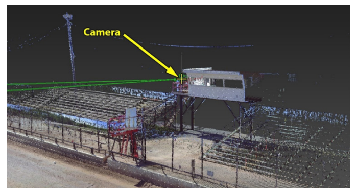
Figure 6 Perspective view of grandstands showing the location of the camera that captured video of the incident.

When reconstructing motor vehicle accidents, causes and contributing factors are analyzed to determine how and why an accident occurred. In forensic engineering,