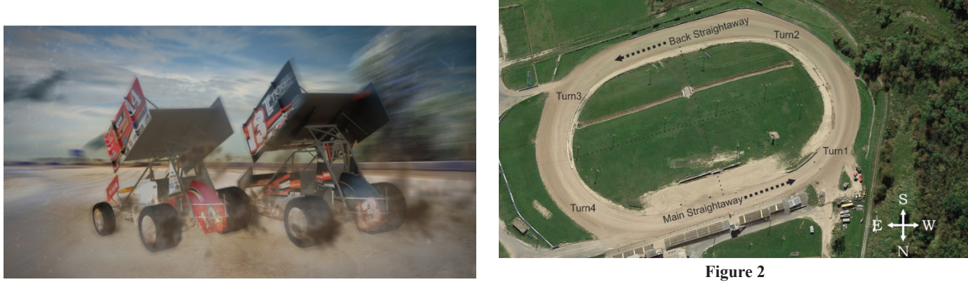
Figure 1 Visualization of SC#13 and SC#14 entering turn 1.

During the race, the decedent driver in SC#13 and a driver in SC#14 entered Turn 1 at approximately the same time as the driver of SC#14 attempted to overtake SC#13. During the overtake, the driver of SC#13 lost control of his vehicle and contacted the west edge track barrier where his vehicle came to a stop near the end of Turn 2.