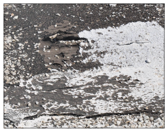
Figure 5 Split/failing section of roofing.

Areas similar to that shown in Figure 5 were observed throughout the roofing systems over the two-story buildings. No areas of impact damage were observed on any of the roofs. Spatter marks observed throughout the property were consistent with only minor hail, approximately 0.25 inches in diameter. Additionally, conversations with onsite maintenance personnel during the inspection revealed that the roof had been leaking for years. This was consistent with observations of the interior spaces.