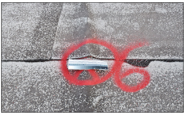
Figure 3 Area identified as wind damaged.

An example of wind damage, as identified by the public adjuster, is shown in Figure 3 .