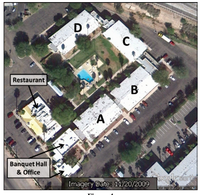
Figure 4 Image of roof from Nov. 20, 2009.