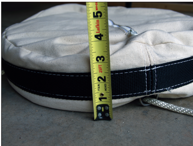
Figure 9 Custom canvas ballast bag