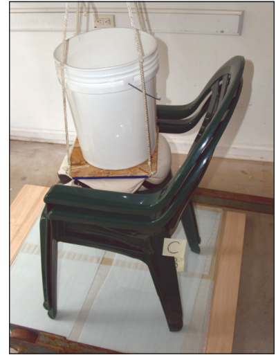
Figure 18 Stacked Chairs B and C