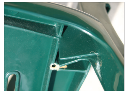
Figure 8 Exemplar chair left side