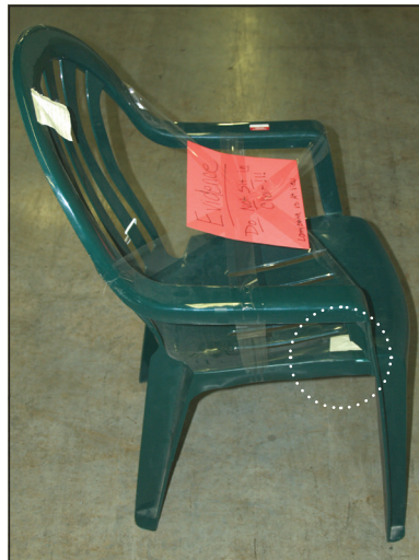
Figure 1 Evidence chair with fracture highlighted