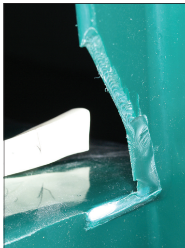
Figure 3 Fractured right armrest support