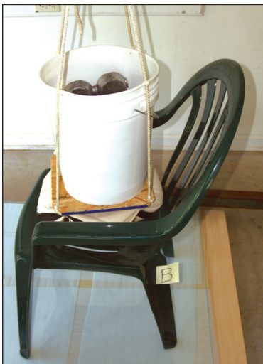
Figure 15 and 16

Chair B before and after 30 minute static 400 pound load