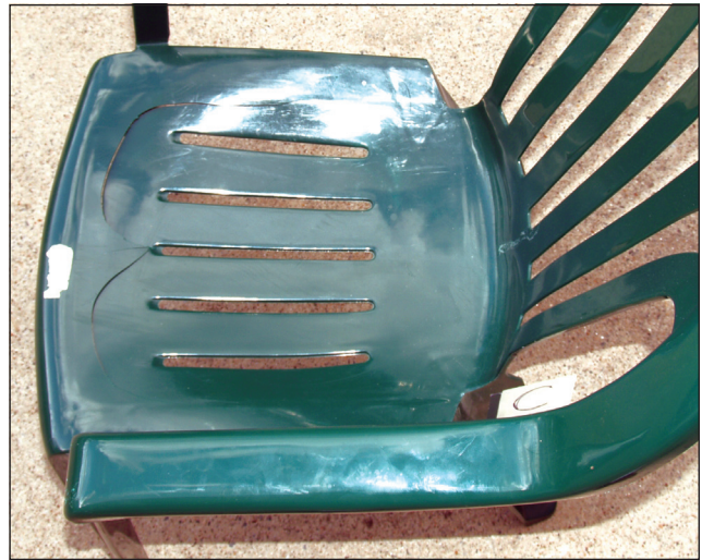
Figure 19 Seat pan fracture on Chair C after impact test