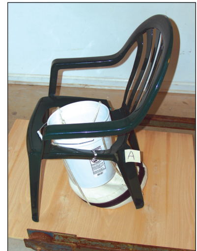
Figure 14 Impact test failure of seat pan