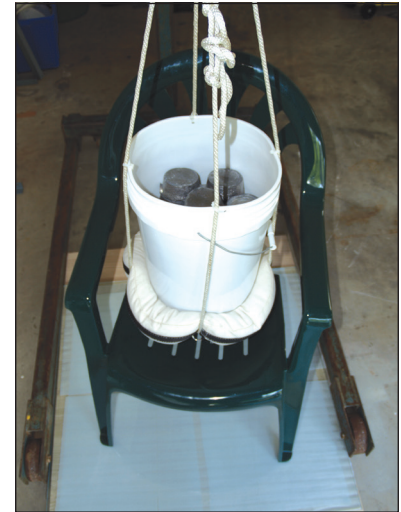
Figure 11 and 12 Chair A static load testing