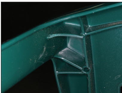
Figure 6 and 7 Broken underseat tabs