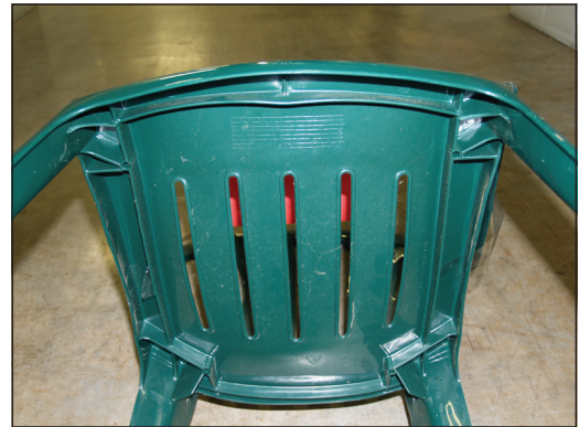
Figure 5 Bottom of evidence chair showing locations of broken underseat tabs