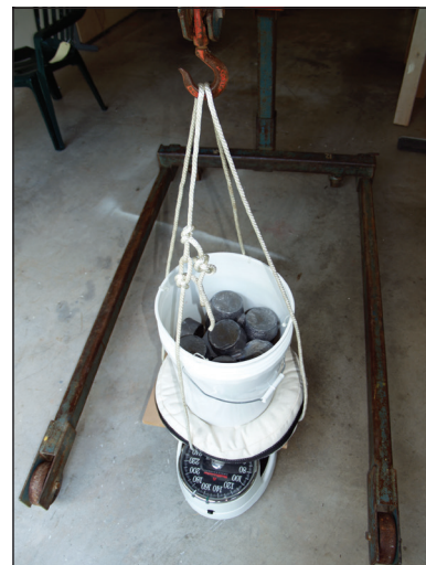
Figure 10 Lead ingots in bucket atop ballast bag