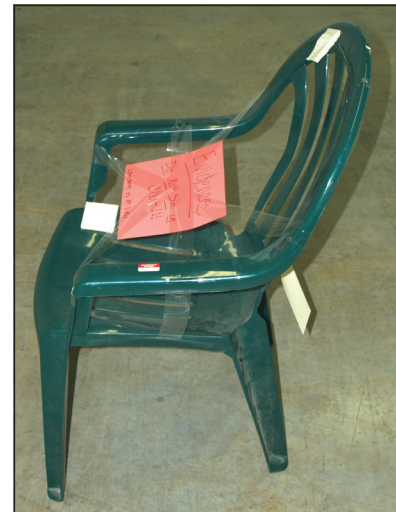
Figure 2 Evidence chair left side