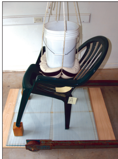
Figure 13 Chair A rear leg test