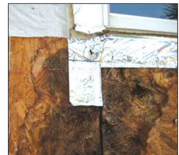
Photo 5 View of Damaged Sheathing

However, while the infrared camera is able to detect conditions consistent with elevated moisture levels within wood frame walls or deterioration of the wood members within wood frame walls, it is not able to detect staining on the wood members within the walls which no longer contain elevated moisture levels and which have not experienced significant section loss. This is not considered to be problematic as given the lack of structural damage, simple remedial measures to prevent further water intrusion are all that is warranted.