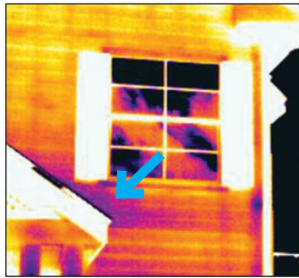
Photo 2 IR Image of Anomaly

Once thermal patterns attributable to sources other than water intrusion damage are eliminated, the remaining thermal patterns are classified as thermal anomalies potentially attributable to either saturation or water intrusion damage. Photo 2 is an Infrared image demonstrating an anomalous thermal pattern at the bottom left corner of the window opening where reflection from adjacent metal roofing has affected the apparent surface temperature of the lap siding. This potential “false positive” was confirmed by the destructive testing performed at the interior face of this wall (Photo 3) where no water intrusion damage was found.