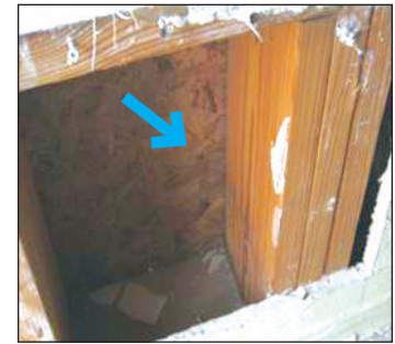
Photo 3 View From Within Wall Cavity

The infrared camera is able to detect anomalous conditions consistent with moisture within the wood members underlying the exterior wall cladding due to the fact that the presence of moisture affects the rate of heat transfer between the individual components of the exterior wall construction. Furthermore, the infrared camera is able to detect potential degradation of wall sheathing due to the fact that this degradation disrupts the continuous path through sequential layers of building materials which subsequently affects the rate of heat transfer between individual components of the exterior wall construction. These mechanisms, referred to as thermal bridging, occur according to the thermodynamic principle that heat always flows towards areas of lower temperatures. These conditions are detected as a subtle variation in surface temperatures of the wall cladding. The fact that wall cladding materials on residential structures are typically comprised of materials such as cementitious stucco or cement composite siding boards, both of which having high capacities to emit energy by radiation (emissivity), contributes to the facilitation of water intrusion and damage detection.